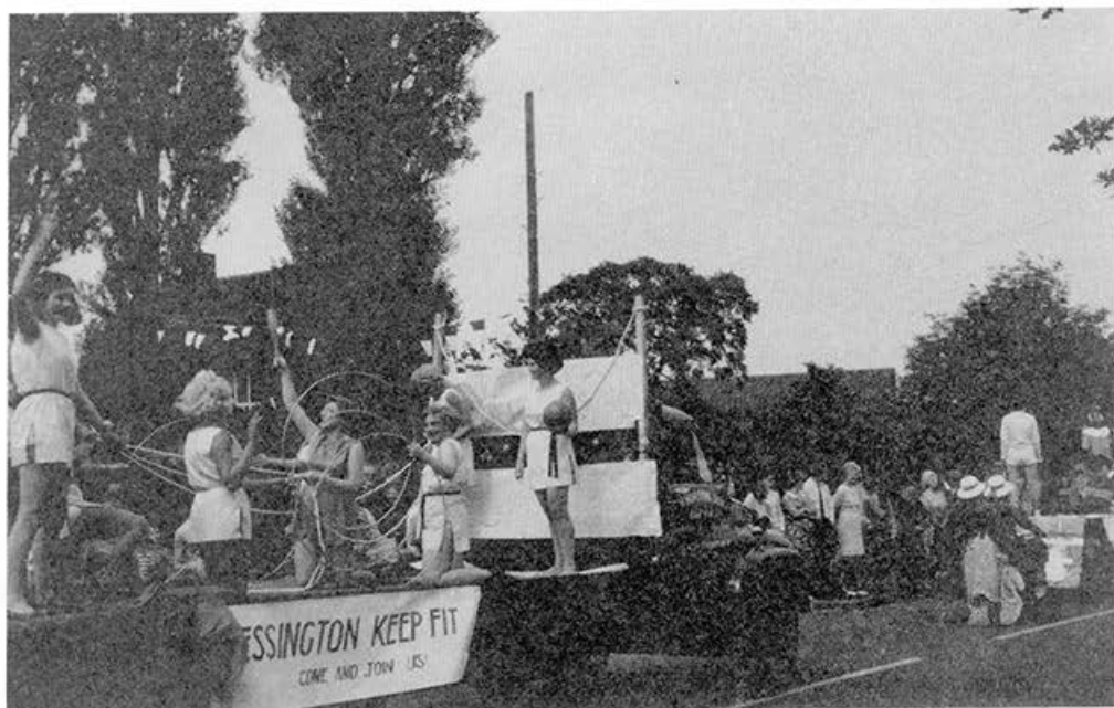
Carnival Atmosphere in the 1960's

On the firm base that was established through Christian Stewardship, the Church was to grow into a well supportive and caring family which in the '90's is still growing. It is ever mindful of the time, talents and money that was and is still given gladly to further the work of God in the Parish of Essington and for the world-wide church overseas.